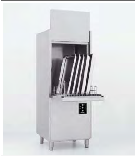
Accessories not included